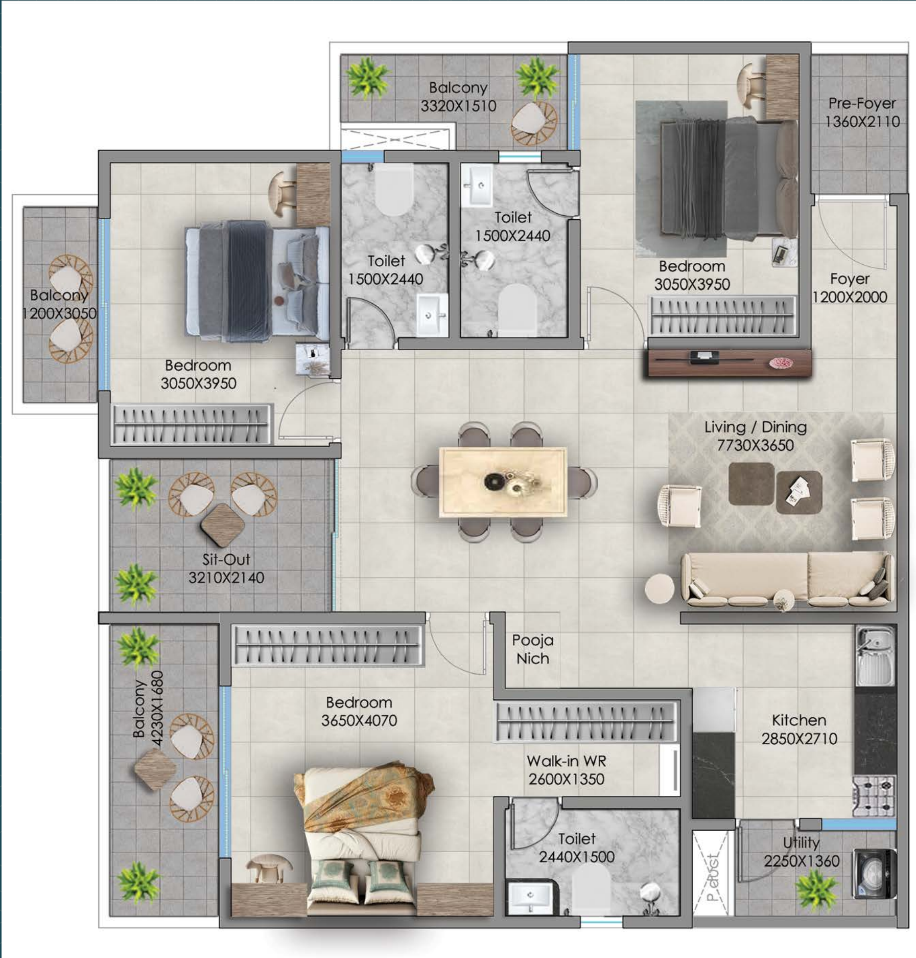
3 BHK UNIT - 03