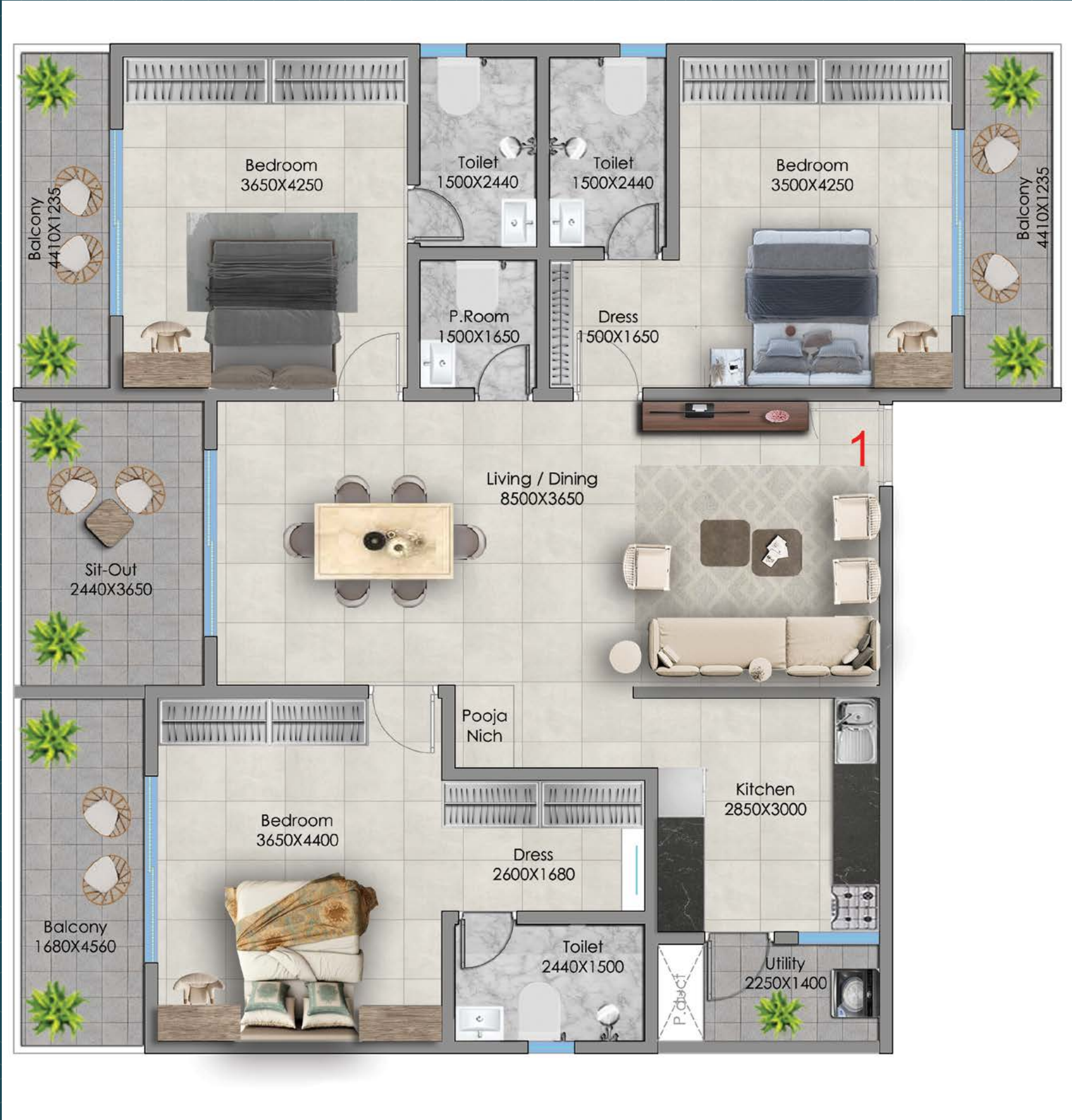
3 BHK UNIT - 01

SVAASA is a masterpiece of modern architecture, where every detail is meticulously curated to create an eco-conscious and luxurious living environment. Smart space planning, eco-friendly elements, and ample natural light ensure a refined and sustainable lifestyle.