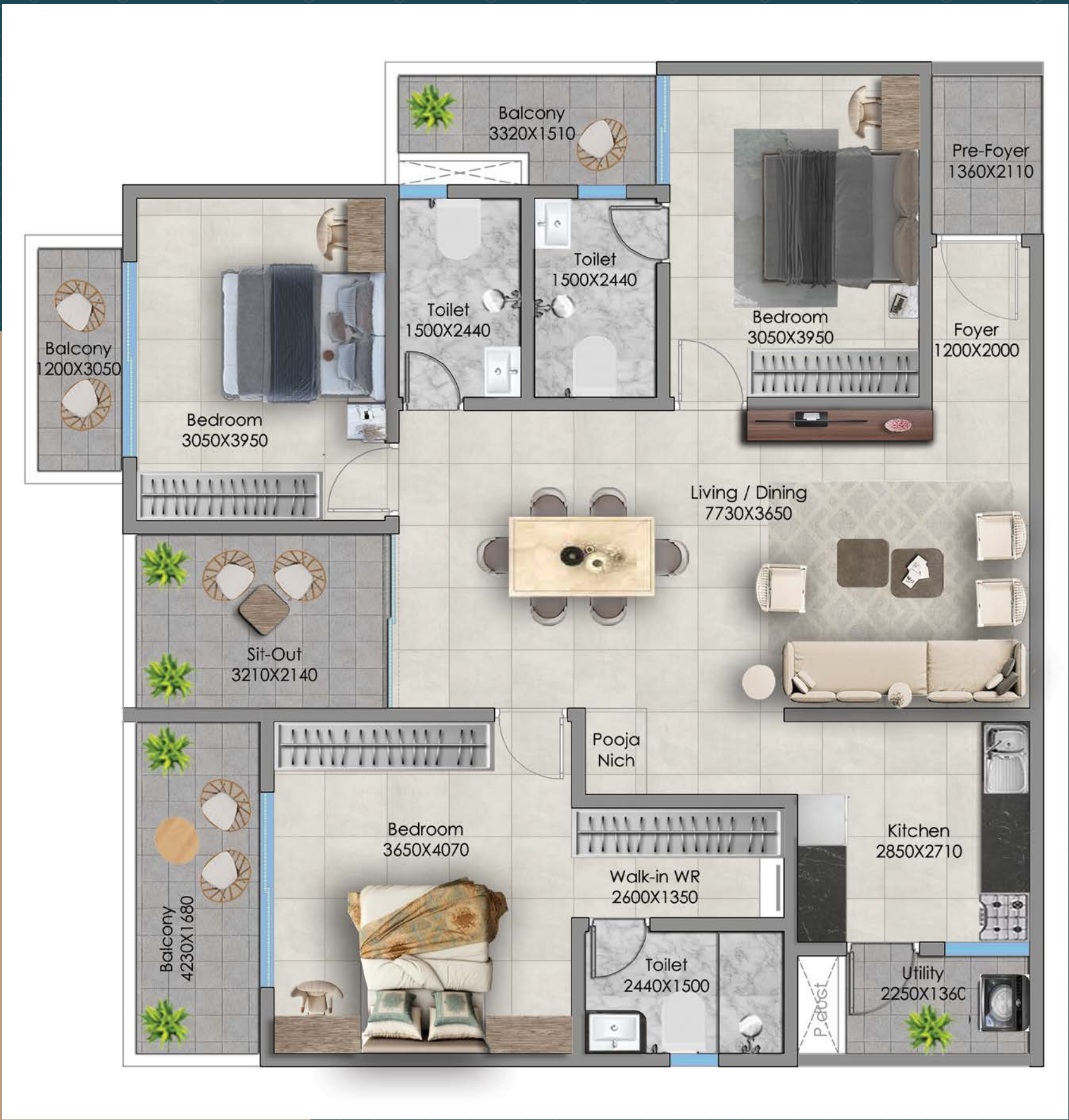
3 BHK UNIT - 02